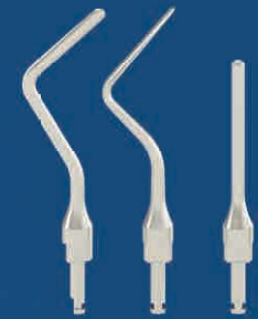
Range of 6 blades for EXO SAFE