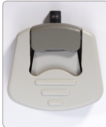
Wireless foot switch