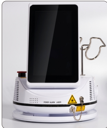
7 inch touch screen

GIGAA LASER launch its second generation dental laser CHEESEII for the dental market in May, 2015, the max output power is 7w, 810nm or 10w, 940nm/ 980nm, there is a big color touch screen, wireless foot switch and customizable pre-setting protocols. As it is becoming more competitive in the dental laser market, our new CHEESEII laser system will offer our partners, dentists and hygienists an effective but affordable unit for their practice.